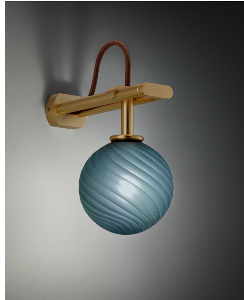
Le Perle wall lamp