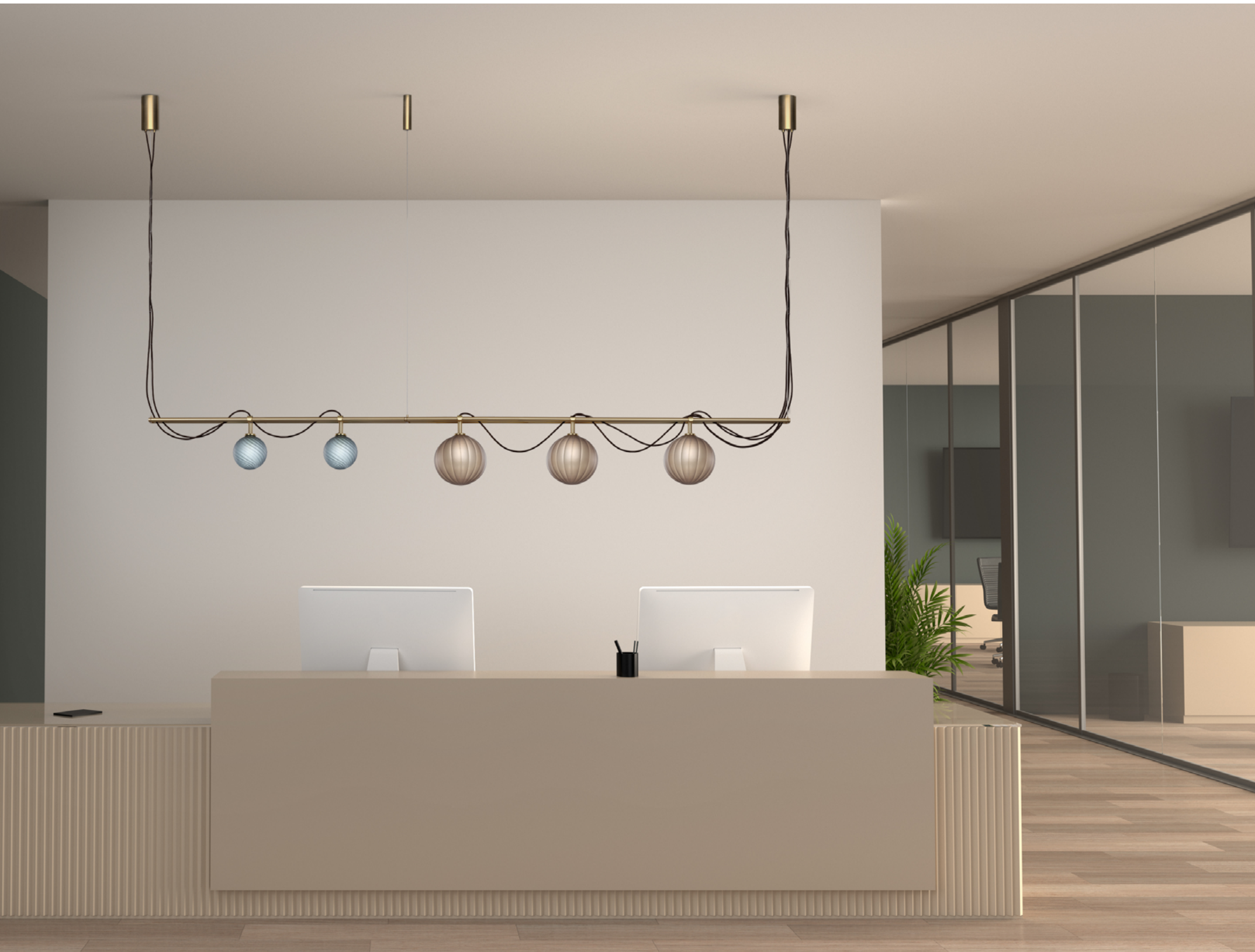
Le Perle project